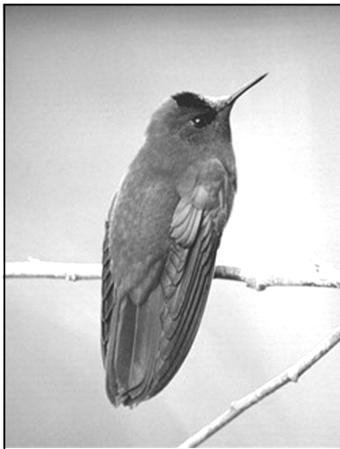
Juan Fernandez Firecrown

Where: Northlake Unitarian Universalist Church