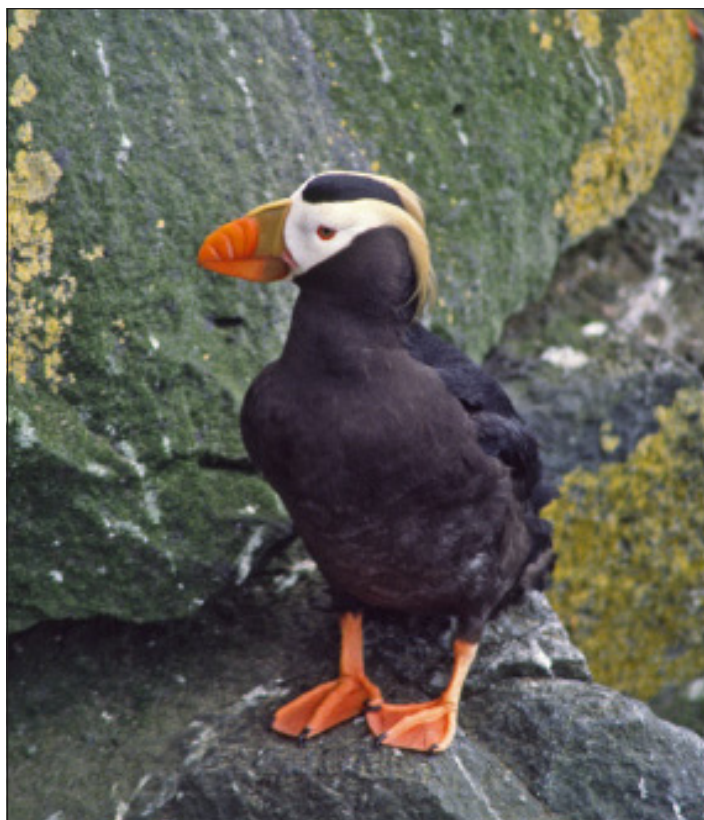
Alaska and westward and declining in SE Alaska, Washington, Oregon and California (Piatt & Kitaysky).

The Tufted Puffin is our largest puffin and is also the most pelagic of the alcids (Family Alcidae , from the Norse for auk) ranging far from land after the nesting period in search of food. Little is known about juvenile birds as they are thought to move to the north central Pacific Ocean for 1-2 years before returning to the coastal islands to breed, possibly in their third year. This long maturation period and the single egg per breeding pair put the survival of colonies at risk from predators such as snakes, rats, gulls, etc. Populations appear to be increasing in the Gulf of