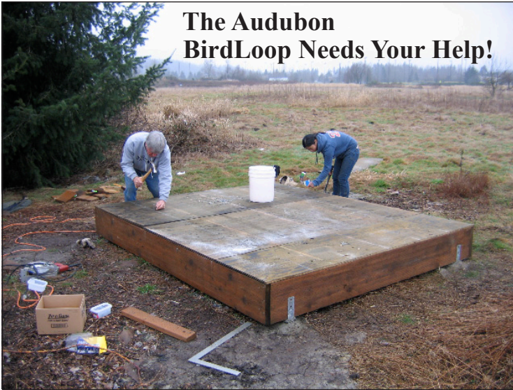
Hard at work in February laying the storage shed floor!

EAS continues to sponsor monthly work parties at Marymoor's Audubon BirdLoop and the more workers the merrier! Also, more