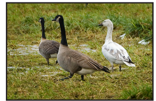
Hopelessly confused Snow Goose amid the Canadas in Snoqualmie Valley