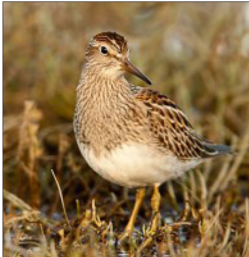
Pectoral Sandpiper by Tim Boyer.

In two evening sessions we'll cover methodologies for sorting out those "brown little peeps." We'll concentrate on viewing similari-