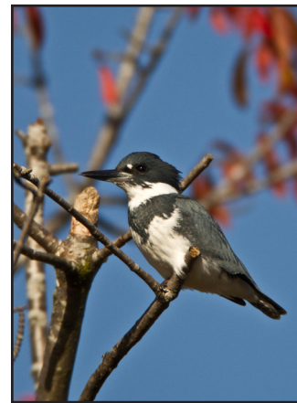
Belted Kingfisher at Gene Coulon Memorial Park

Roughly bordered by I-5 on the east, Samish Bay on the north, Padilla Bay on the west, and Bayview Ridge on the south, the Flats are a rich agricultural area that attracts birds of many kinds from about late October into February and March. The fields usually provide a good supply of rodents (good for hawks, eagles, falcons, and owls), are often flooded (good for ducks, geese, and swans), and have lots of mud (good for shorebirds).