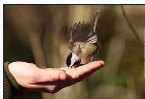
Black-capped Chickadee by Caren Park.