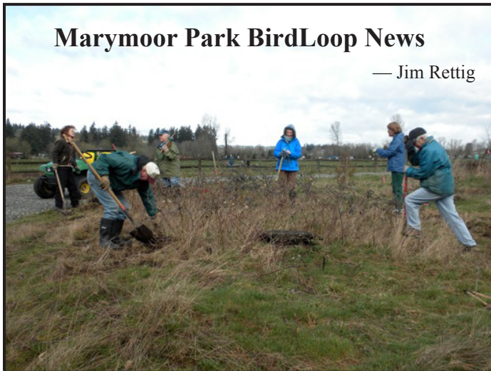
Clearing out the invasives!

In early April, 13 volunteers spent a good day at Marymoor restoring habitat and building the storage shed. Despite lots of rain on Friday, we enjoyed sunshine on Saturday! See the photos of those clearing blackberries and those putting up the walls of the shed.