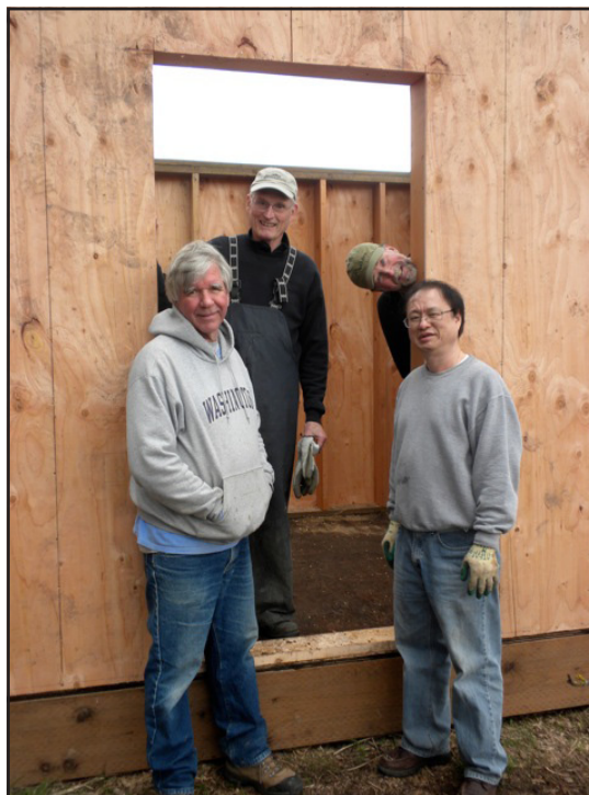
The storage shed walls are up!

Work parties are held every first Saturday of each month, 9 AM to noon. We meet at the SE corner of Parking lot G. Parking passes are provided at no cost. The next work party is scheduled for May 7. Spend a Saturday morning with others who enjoy the outdoors and working for the birds!