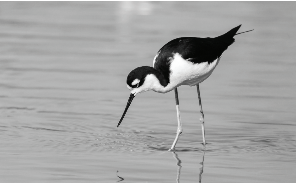
Black-necked Stilt. Photo by Mick Thompson

Length: 14 inches Wingspan: 29 inches Weight: 6 ounces (160 grams) AOU Alpha Code: BNST