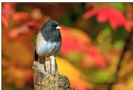
Dark-eyed Junco is one of the most likely backyard birds in our area.

The GBBC website, www.birdcount.org , makes it easy for young and beginning birders to get started, with a Tricky IDs feature (under Learn About Birds) and links to The Cornell Lab of Ornithology's outstanding online bird guides.