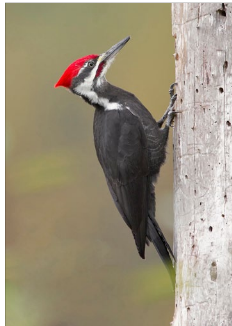
Pileated Woodpecker by Duke Coonrad

Anyone interested in going, contact Stan Wood: 425-392-4557 or stanwood@mindspring.com . Stan will then make reservations and arrange carpooling.