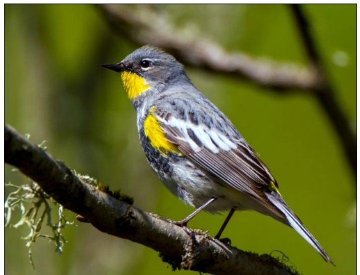
Yellow-rumped Warbler (Audubon's) by Mick Thompson