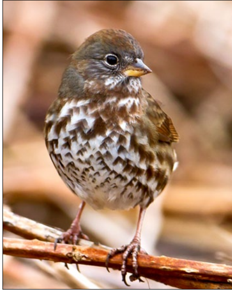
Fox Sparrow at Marymoor Park

This regional park in Redmond provides home for resident birds, a wintering area for waterfowl, and a resting place for migrating birds. It is also home to the Audubon BirdLoop, where we will walk on level ground for about two miles along the Sammamish Slough and through the East