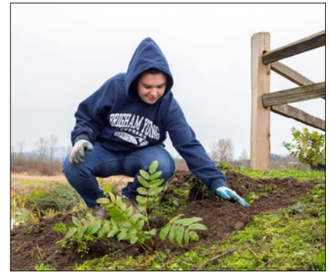
A youth group volunteer replants salvaged mahonia at the Audubon BirdLoop in Marymoor Park in January.